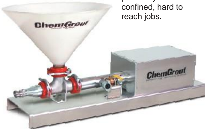
CG-050 Air Powered

Lightweight aluminum construction offers portability for confined, hard to reach jobs.