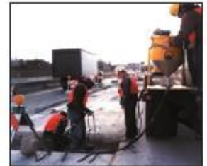
Highway Dowel Rods