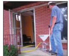
Filling Door Frame